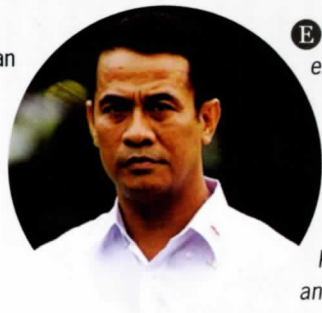
Menteri Pertanian Amran Sulaiman

I Kami meyakini sepenuhnya bahwa ekspor dan investasi merupakan dua aspek yang memiliki peranan penting dalam meningkatkan pertumbuhan ekonomi nasional. Oleh karenanya, Kementerian Pertanian (Kementan) secara konsisten terus mendorong percepatan ekspor produk-produk pertanian dari Indonesia ke berbagai negara sahabat. Upaya ini merupakan langkah nyata yang dilakukan Kementan untuk meningkatkan pertumbuhan ekonomi dan kesejahteraan masyarakat.