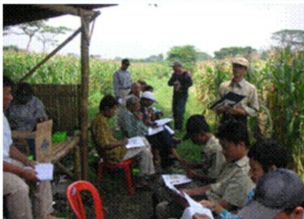
Figure 5. On field visit

On-field visits were organized during the third cropping season to observe the crop development, and to present and discuss the demonstration plot results with local authorities, regional farmers and water users.