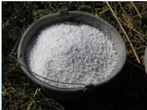
Figure 4. fertilization costs

By applying the BPTP-DP recommended fertilization doses for corn crop (Urea: 300-350 Kg/ha + SP36: 100-150 Kg/ha or + Phonska: 150 Kg/ha) it was observed a good crop development and a significant reduction of fertilization cost (- Rp. 90.000,-)