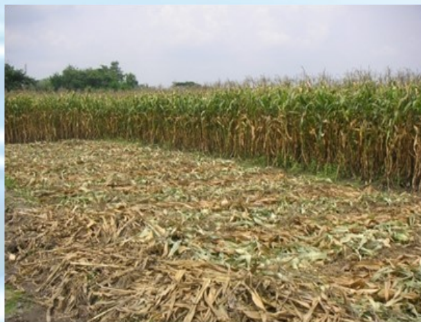
Figure 5. corn production

By applying the Project irrigation and fertilization recommendations it was observed the same level of maize production.