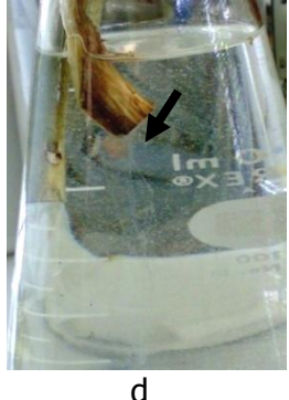
Figure 1. Symptoms of bacterial wilt on physic nut (a, b, c) and bacterial masses exude from infected plant and inside vascular tissue (d)