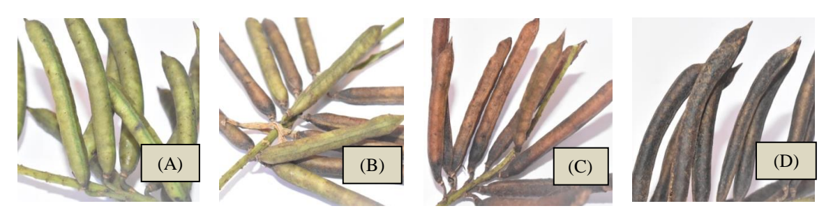
(A): Green pod; (B): brownish green pod; (C): Brown pod; (D): Black pod