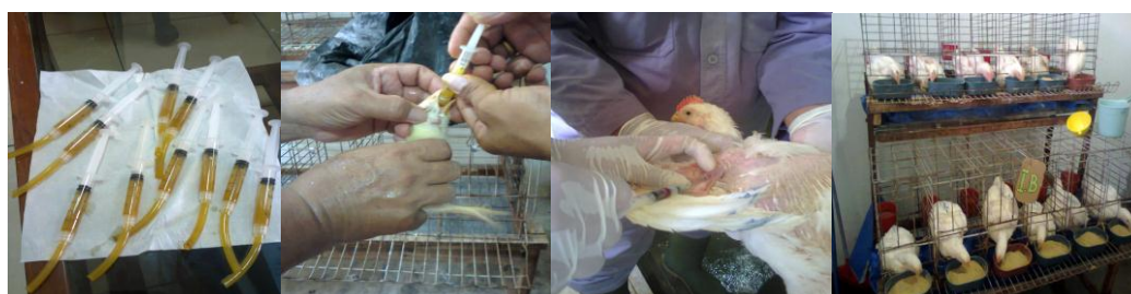
Figure 2. Application of jamu in chickens Gambar 2. Aplikasi jamu pada ayam

Serum antibody titer is the indicator of humoral immunity. This experiment results showed that the antibody titers only in the third group at each time point were higher than that from control group. Suggesting that they could promote humoral immunity and that the maintenance time of their effects was the longest. The third formula promote the production of antibody in the immunosuppressant animals and could enhance the antibody titer of ND vaccine.