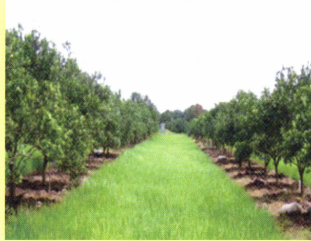
Figure 3. rice-orange patterns at surjan system in tidal swamplands.