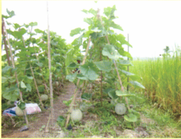
Figure 2. Rice-melon patterns at surjan system in tidal swamplands