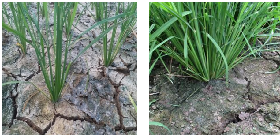
Figure 3. The F 3 rice line progenies of Sikuneng × IRBB27 grew well in dry, non-puddled and non-saturated soils with supplemental intermittent irrigation system.

Development of new rice varieties adapted to global climate change is highly needed in order to maintain high productivity under extreme environmental conditions despite fertilizer or water shortages [6,7]. A possible solution for this is by developing GSR through a plant breeding program using highly adaptive local varieties, which are crossed with newly available superior lines. Selection can then be performed to obtain GSR cultivars with high productivity and efficient in fertilizer and water input [14].