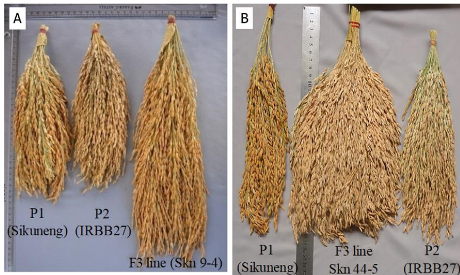
Figure 2. F 3 rice lines and their two parents (P1 Sikuneng and P2 IRBB27). (A) Panicle length of Skn 9-4 line was significantly longer than their parents. (B) Panicles number of Skn 44-5 line was significantly higher than their parents.

accounts for more than 60% of the total area planted with rice and has contributed about two billion dollars for China's national economy [13]. It was also discovered that the F 3 rice lines grew well in the aerobic system that was applied by cultivating the rice plants in dry, non-puddled and non-saturated soils with supplemental intermittent irrigation (Figure 3).