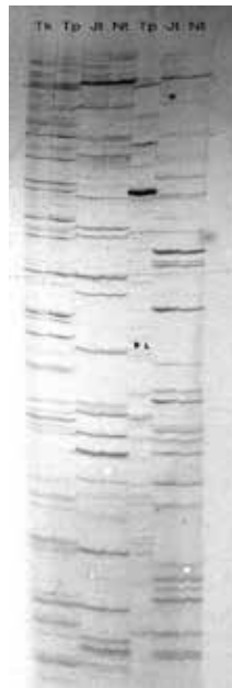
Figure 2. Banding pattern produced by AFLP method. Tk is the predigested tomato DNA from the kit, Tp is pure tomato DNA from the kit that was digested along with the two Jatropha accession (Jt and Nt). The first four lanes were amplified using different specific primer combination to the last three lanes.

Gambar 2. Pola pita yang dihasilkan oleh metoda AFLP. Tk adalah DNA tomat yang sudah dipotong dengan enzim restriksi (bawaan kit AFLP); Tp adalah DNA tomat murni yang sudah dipotong dengan enzim (bawaan kit AFLP); dan DNA dari dua aksesori jarak pagar (Jt dan Nt). DNA pada empat lajur pertama telah diamplifikasi dengan kombinasi primer spesifik yang berbeda dengan tiga lajur terakhir.