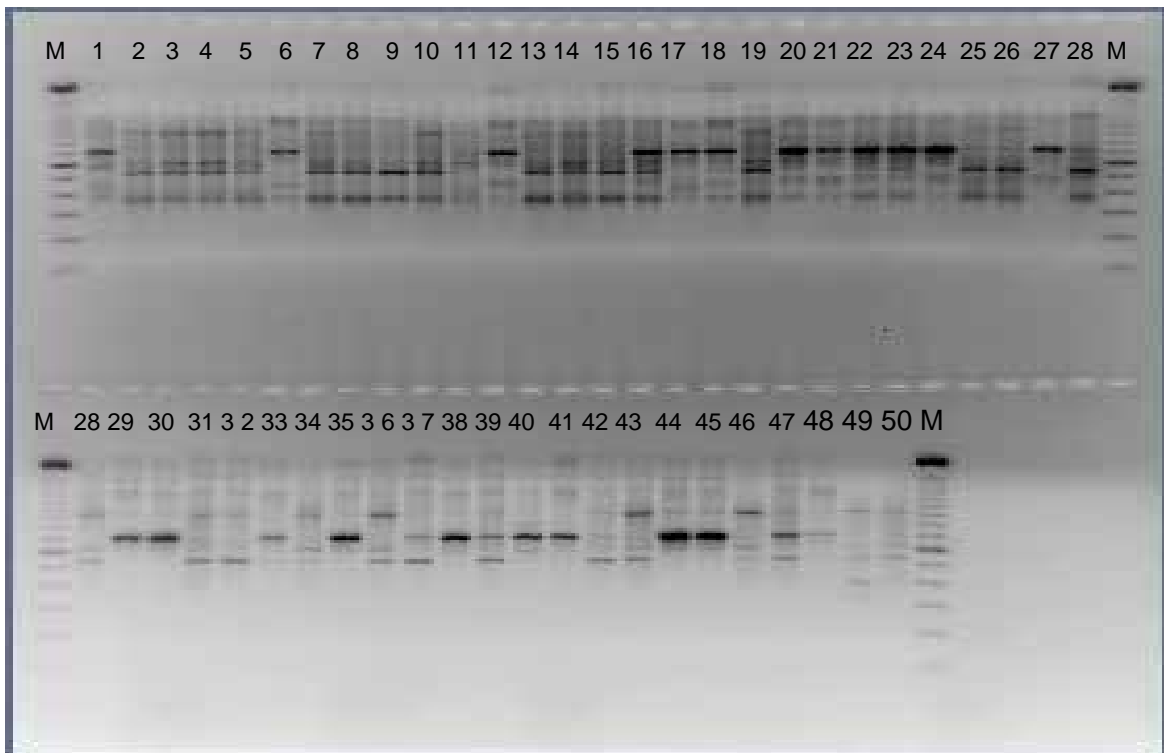
Figure 1. The banding pattern of PCR product using RAPD 5 primer on 50 Jatropha accessions. M = 100 bp DNA ladder; 1-50, fifty Jatropha accessions used in the RAPD analysis.

The biggest disadvantage of RAPD method is that they are more sensitive to variations during the PCR reaction process and therefore the resulting DNA bands are often inconsistent. This problem can be reduced by maintaining consistency in every PCR reactions and duplicating the same PCR reactions at least twice. Only RAPD bands that consistently appear in each PCR duplications can then be used as markers and for genetic analysis. The bands that are not consistent must be discarded from the analysis.