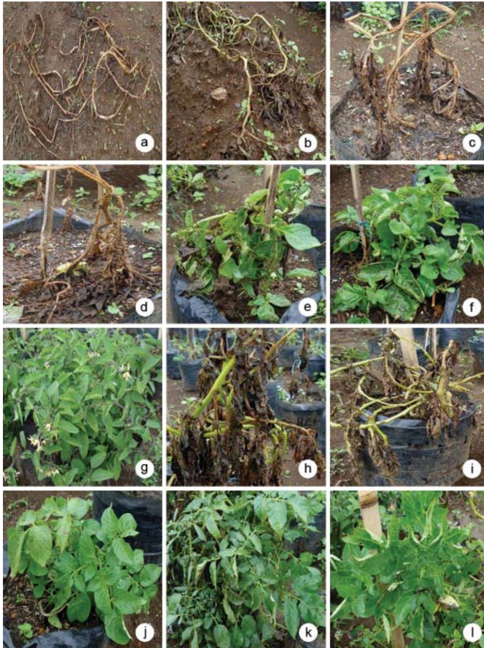
Fig. 2. Resistance evaluation of potato late blight ( P. infestans ) on populations of crosses between transgenic potato and non-transgenic one in confined field trial at Pasir Sarongge, Cianjur, West Java at 77 days after planting; (a) border Katahdin, (b) Granola, (c) Atlantic, (d) non-transgenic Katahdin, (e) transgenic Katahdin SP904, (f) transgenic Katahdin SP951, (g) Solanum bulbocastanum PT29, (h) clone A10 (Atlantic x transgenic Katahdin SP904), (i) clone B59 (Atlantic x transgenic Katahdin SP951), (j) clone B8 (Atlantic x transgenic Katahdin SP951), (k) clone C183 (Granola x transgenic Katahdin SP904), (l) clone D77 (Granola x transgenic Katahdin SP951).

be further developed before they are used as practical resistance potato varieties. We hope these resistant potato clones will reduce huge amount of fungicide application as traditionally used by local farmers as many as 20-30 times during a single season of potato crop (Adiyoga 2009).